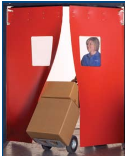
Frame not included

Kleerstrip's Optima ImpacDor® may be field modified quickly and easily due to our exclusive one-piece construction.