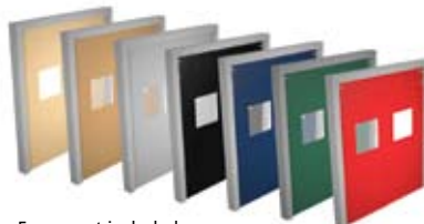
Frame not included