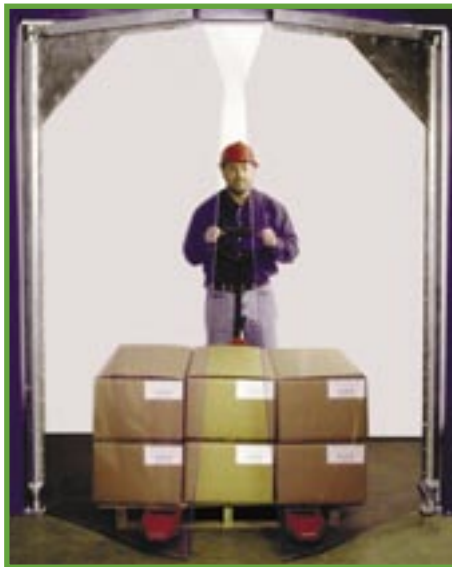
Frame not included

The adjustable torsion spring closing mechanism allows the