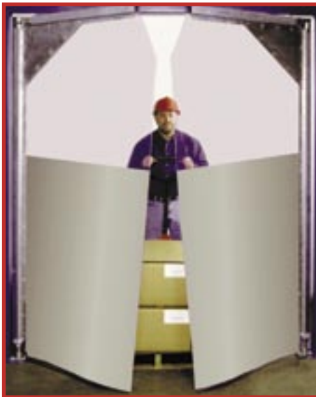
Frame not included

The adjustable torsion spring closing mechanism allows the