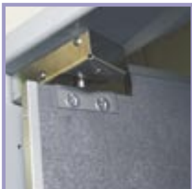
EZ hinge system