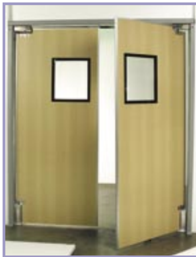
Shown with optional jamb guards

The FS-500 is the perfect solution for demanding food service, retail and light industrial applications seeking to provide a visual barrier or a damper to air currents in busy doorways. Colorful 1/8" (3mm) ABS facings are bonded to a 1/2" (13mm) solid core to resist palletized loads, yet remain light enough to swing freely in high volume foot traffic. This versatile, attractive door is supported by the easily installed EZ hinge system for two-way 125 degree swing. The hinge's unique "offset pivot" ensures smooth, effortless operation to facilitate traffic flow.